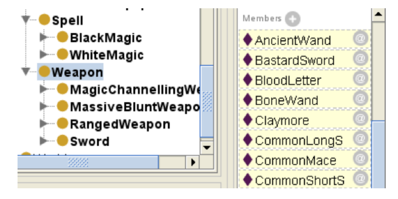
FIGURE 1. Using DL inferences to obtain individuals that are members of the class Weapon

3.2.1. Population of the Game. We started by giving a character the possibility of being one of 4 disjoint races: Human, Elf, Orc and Goblin. Each race can only use certain objects. We defined the ontological class UsableEntiy that contains all the entities in the game that a character can use (the equipment): weapons, armor, items and spells.